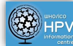
WHO/ICO Information Centre on HPV and Cervical Cancer