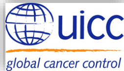
Union for International Cancer Control