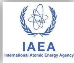
International Atomic Energy Agency